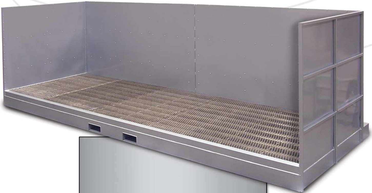
Large Wash Booth with Sidewalls