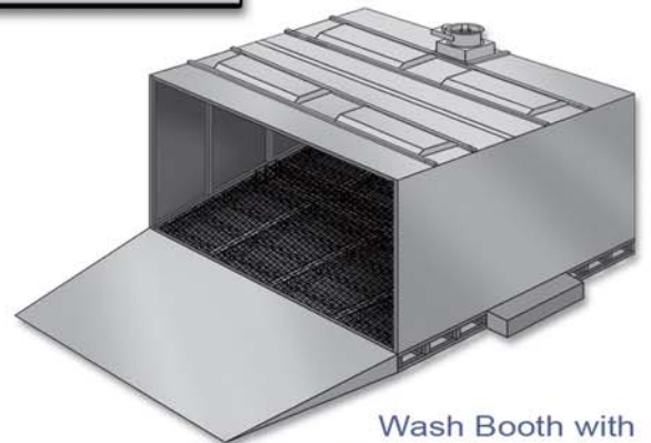
Wash Booth with Ramp and Exhaust